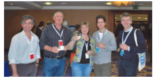
The usual suspects

After a hearty lunch and some networking with our sponsors, we finished off the day with the