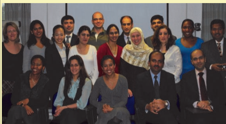
The graduating class with the Cardiff DCD team

Congratulations to all the MSc graduates and good luck for the future!